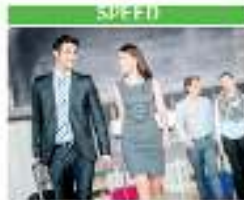
24/7 shuttle bus