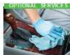
Selecting the Valet Service gives you the option of all and detailing services during your stay.

VANCOUVER • EDMONTON • TORONTO • OTTAWA • MONTREAL • HALIFAX • WINNIPEG