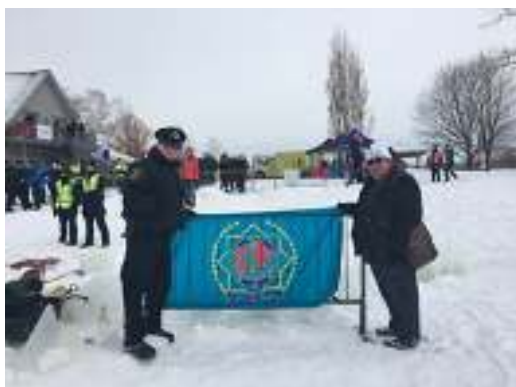
Our IPA Flag was flown at the event.

We were informed that additional activities will be held throughout the year including the pulling of an airplane as well as a locomotive. IPA Region 7 were challenged to participate in these upcoming events. I believe that we will be up for the challenge!