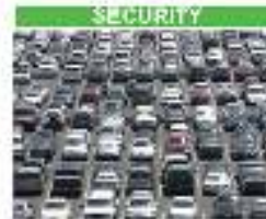
Well lit, secured lots

Now available to all Members – take advantage of these great savings. Park'n Fly's "Best Value" in Airport Parking can be used for business or personal travel.