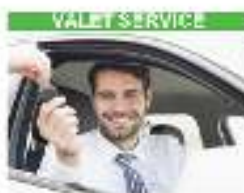
Just pull up, check in and go. We park, you fly. It's that easy!