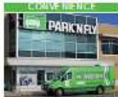
Minutes to airport terminal