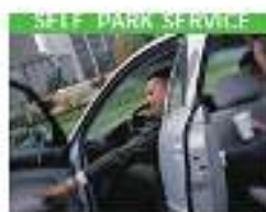
You park, we pick you up and drop you off at the terminal - 24/7.