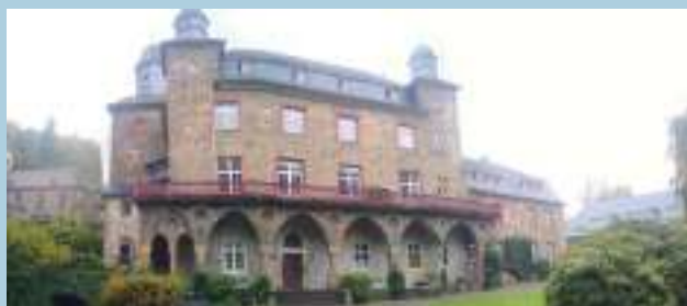
Above: The brooding and often mysterious Gimborn Castle, built in 1273 by the Duke of Berg located near Marienheide, and approximately 45 kilometers north east of Cologne, Germany.

I signed up for the course On Terrorism with IBZ Schloss Gimborn because of a newly developed interest in the prospect of de-radicalization. I had been following international news relating not only to the Islamic State as a terrorist organization but also home-grown terrorism and the radicalized, hate-minded individual. As I look over my notes from the course, I can see that I began to understand how these groups eventually become radicalized – including the profound socio-economic implications that one is born into and the exposure to messaging that follows. Radicalized messaging is well-planned and calculated. It preys on vulnerabilities in each person that make them susceptible to be easily influenced.